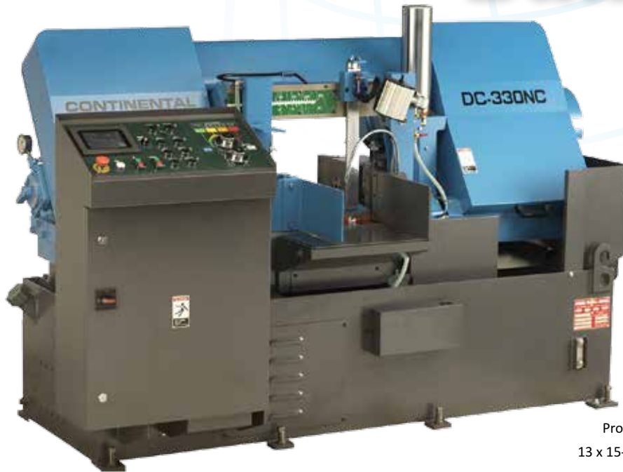
DoALL DC-330NC Production Column Saw – 13 x 15-3/4" Rectangular Capacity and 13" Round Capacity